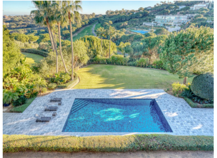
Beautiful pool and garden