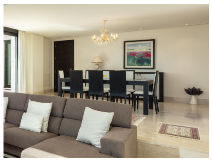
Large living and dining area