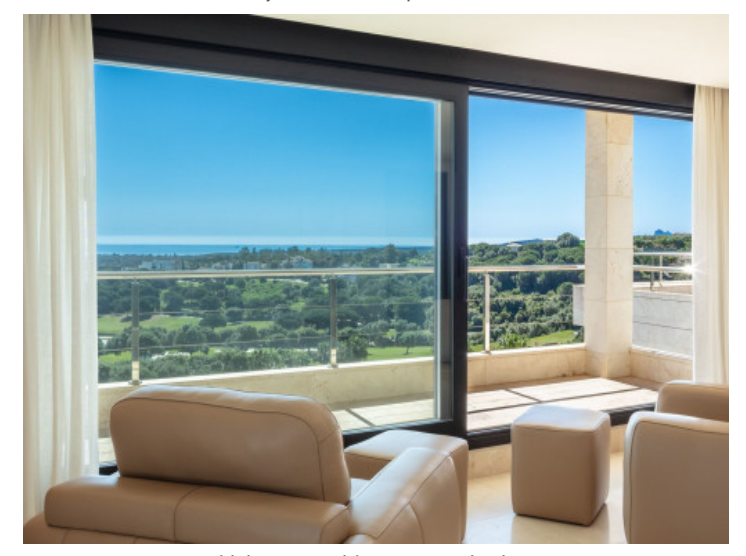
Living area with a panoramic view