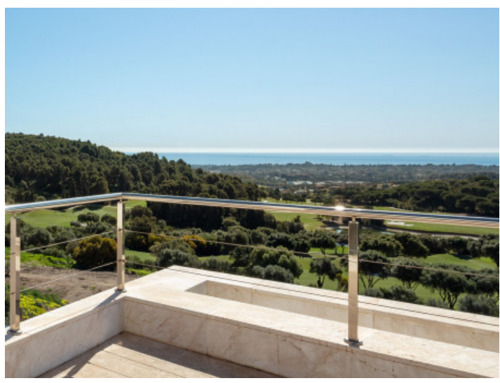
Sunny terrace with splendid views