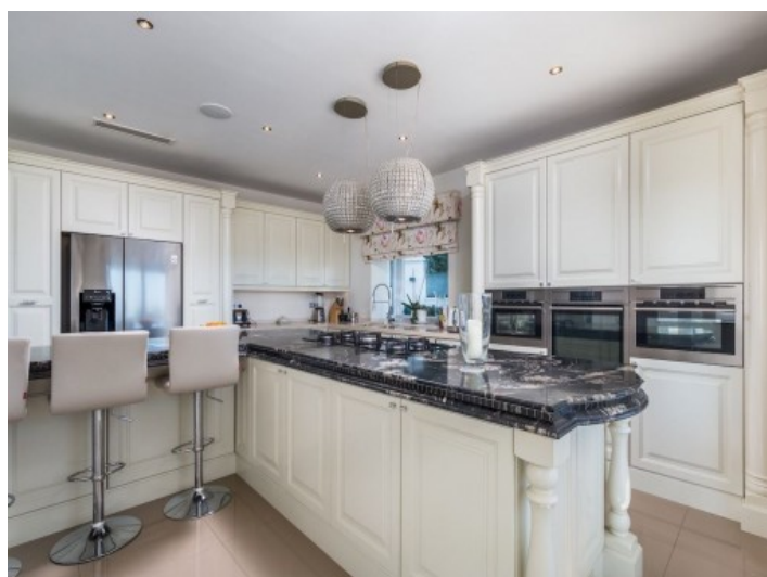
Modern and fully equipped kitchen

All information is correct to the best of our knowledge. Errors and prior sale excepted. This prospectus is purely for information purposes. Only the notarized deed of sale is legally binding.