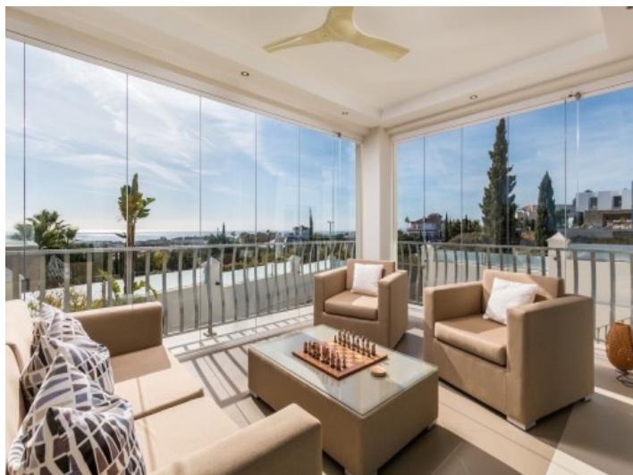
Guest apartment with stunning sea views