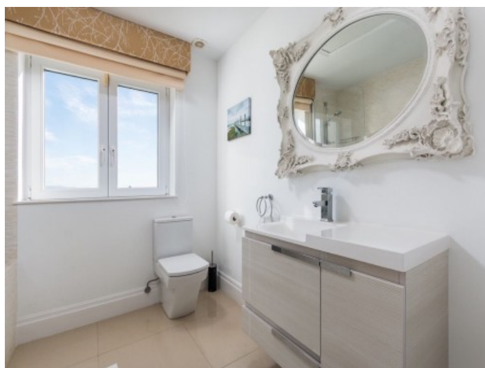
One of 6 bathrooms

All information is correct to the best of our knowledge. Errors and prior sale excepted. This prospectus is purely for information purposes. Only the notarized deed of sale is legally binding.