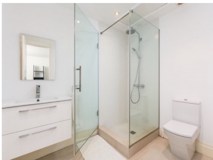
One of 6 bathrooms