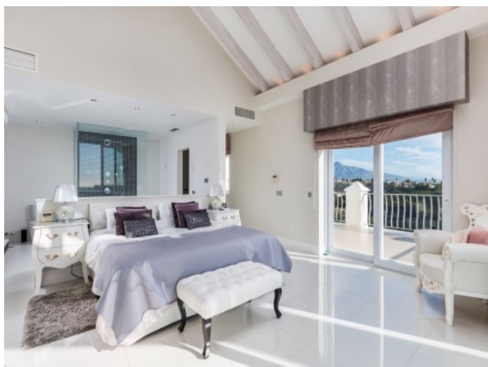
One of 9 bedrooms