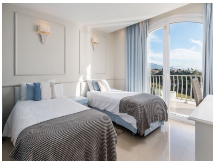
One of 9 bedrooms