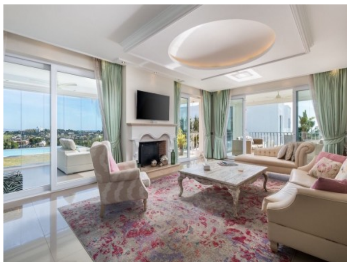
Cosy living area with fireplace