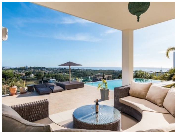
Well-tended outdoor area