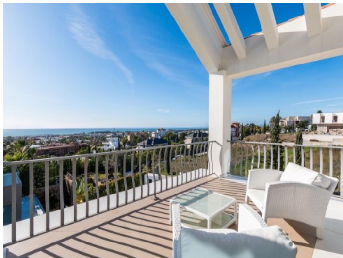
Impressive sea views

All information is correct to the best of our knowledge. Errors and prior sale excepted. This prospectus is purely for information purposes. Only the notarized deed of sale is legally binding.