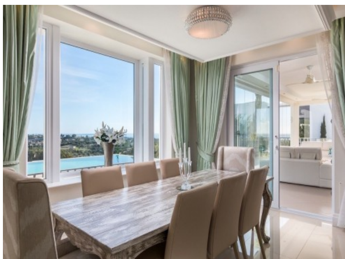
The dining area offers space for up to 8 people