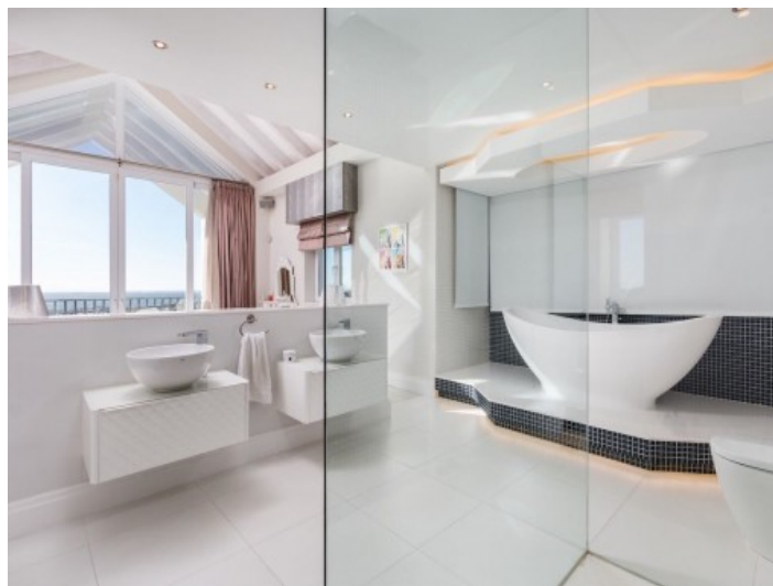
One of 6 bathrooms