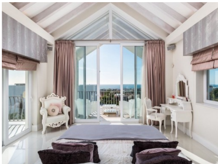
One of 9 bedrooms