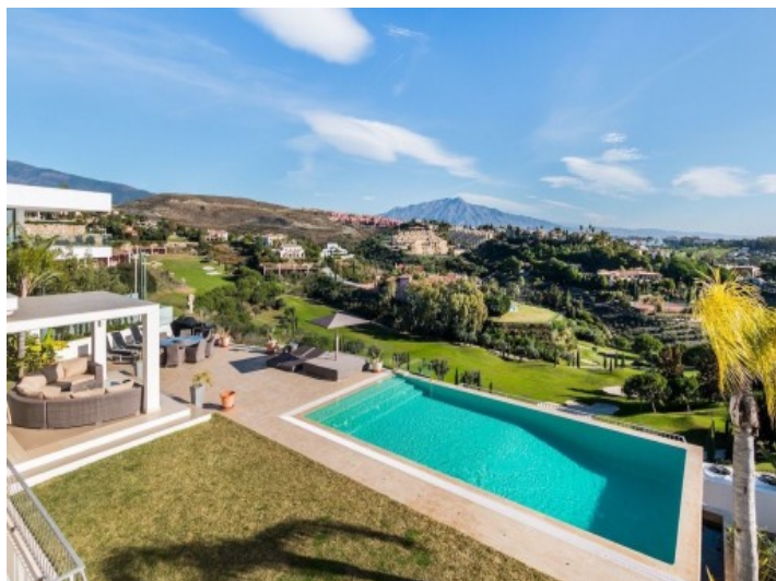
Fantastic mountain views