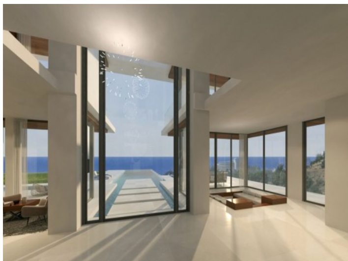
Inviting entrance area