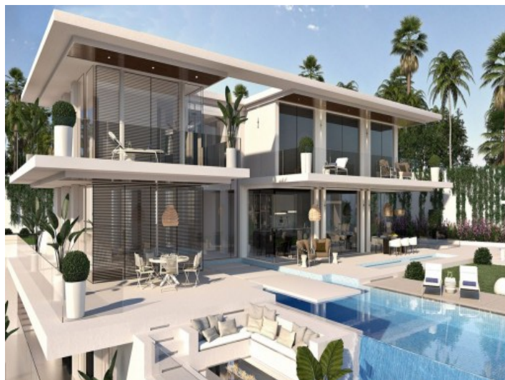
Alternative view of the outdoor area with infinity pool