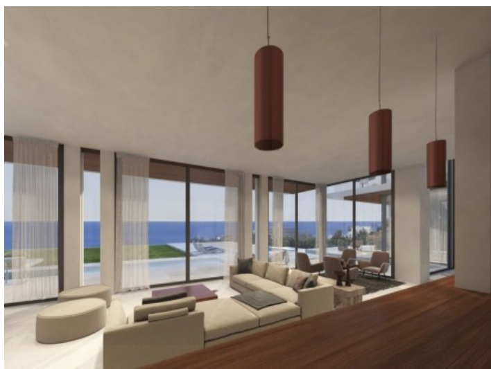
Light-flooded living area with open views