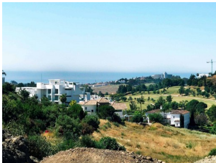
Alternative view of the landscape

All information is correct to the best of our knowledge. Errors and prior sale excepted. This prospectus is purely for information purposes. Only the notarized deed of sale is legally binding.