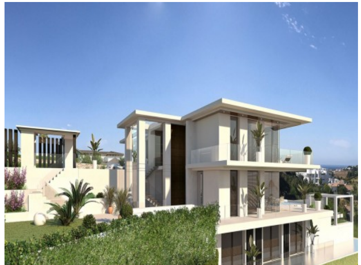
Exterior view of the building

All information is correct to the best of our knowledge. Errors and prior sale excepted. This prospectus is purely for information purposes. Only the notarized deed of sale is legally binding.