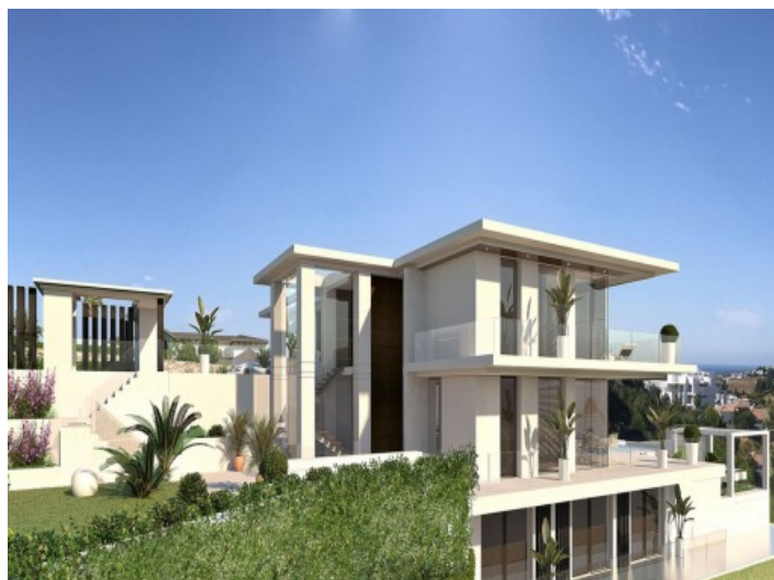
Exterior view of the building

All information is correct to the best of our knowledge. Errors and prior sale excepted. This prospectus is purely for information purposes. Only the notarized deed of sale is legally binding.