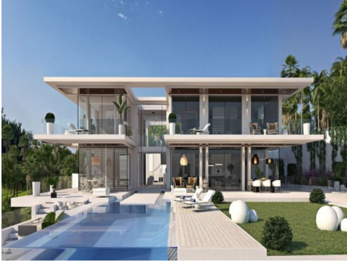
Front view of the modern villa