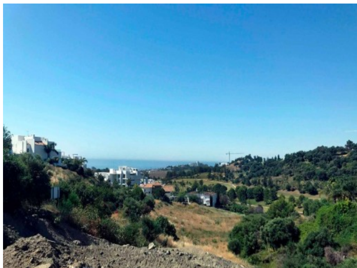
Surrounding landscape with great views