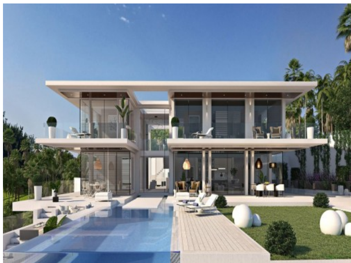
Front view of the modern villa