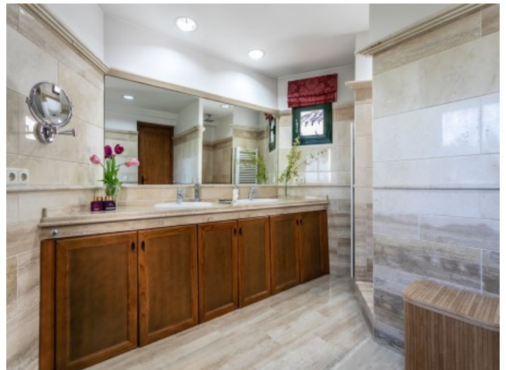
Bathroom with daylight and shower