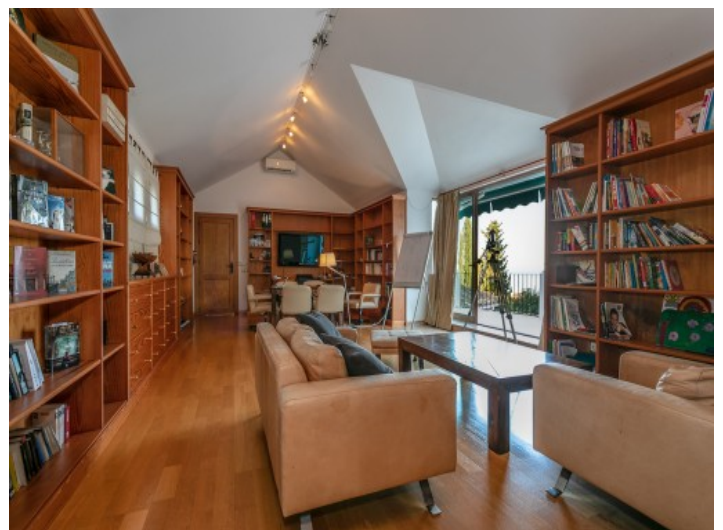
Reading room with access to the terrace

All information is correct to the best of our knowledge. Errors and prior sale excepted. This prospectus is purely for information purposes. Only the notarized deed of sale is legally binding.