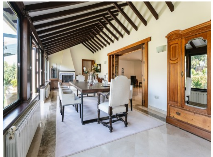
The dining area offers space for up to 10 people