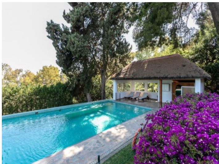
Alternative view of the pool area