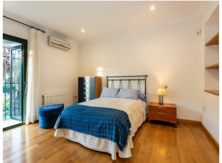
Bedroom with french balcony