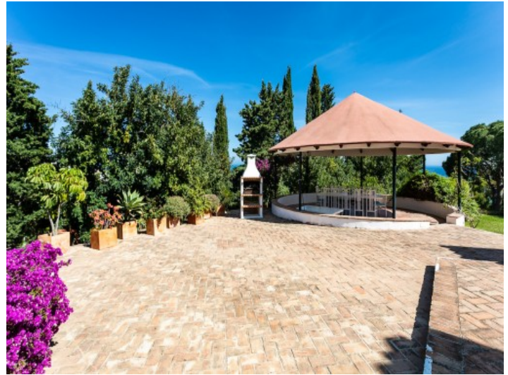
Spacious outdoor area with pavilion and sea views