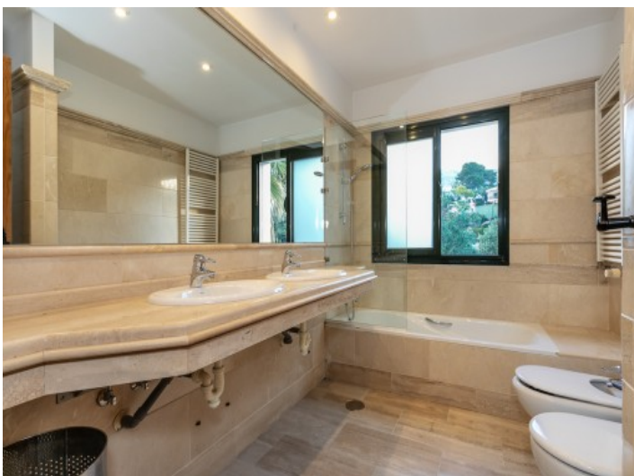
Another bathroom with bathtub