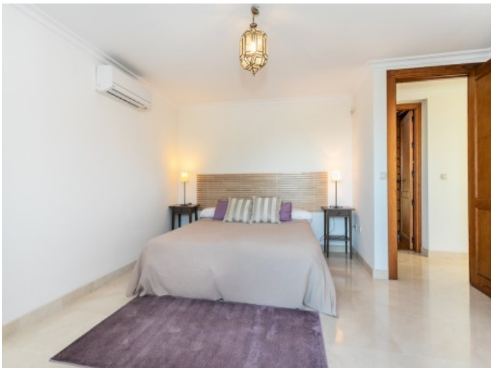
Another comfortable bedroom