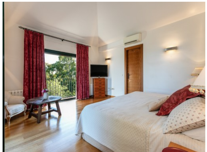
Cosy bedroom with double bed

All information is correct to the best of our knowledge. Errors and prior sale excepted. This prospectus is purely for information purposes. Only the notarized deed of sale is legally binding.