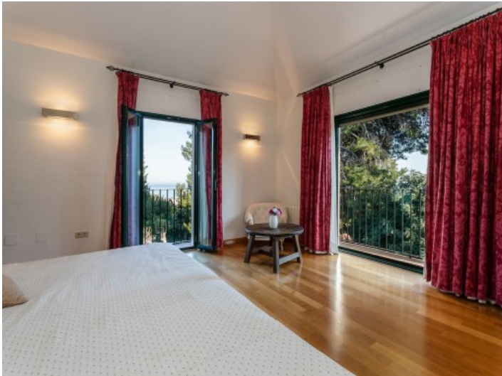
The bedroom offers stunning sea views