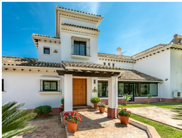
Front view and entrance area of the villa

All information is correct to the best of our knowledge. Errors and prior sale excepted. This prospectus is purely for information purposes. Only the notarized deed of sale is legally binding.