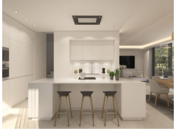
Modern, fully equipped kitchen