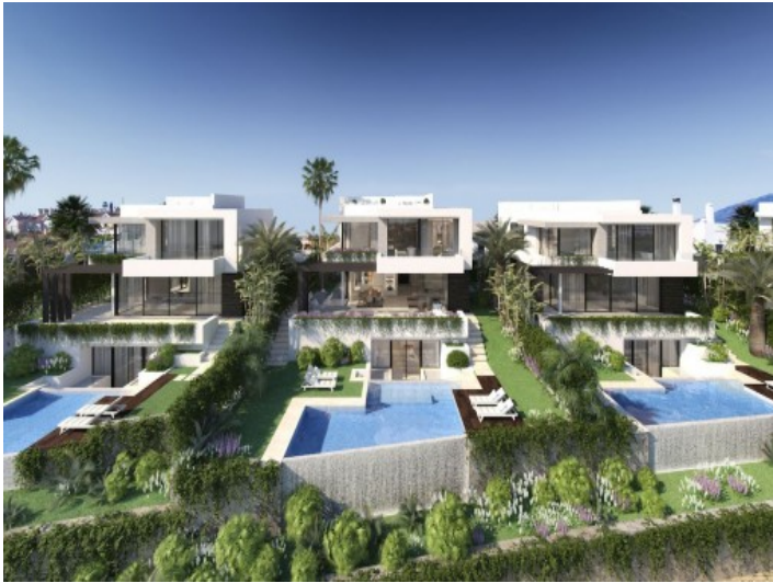
Stunning villa with private pool in Estepona