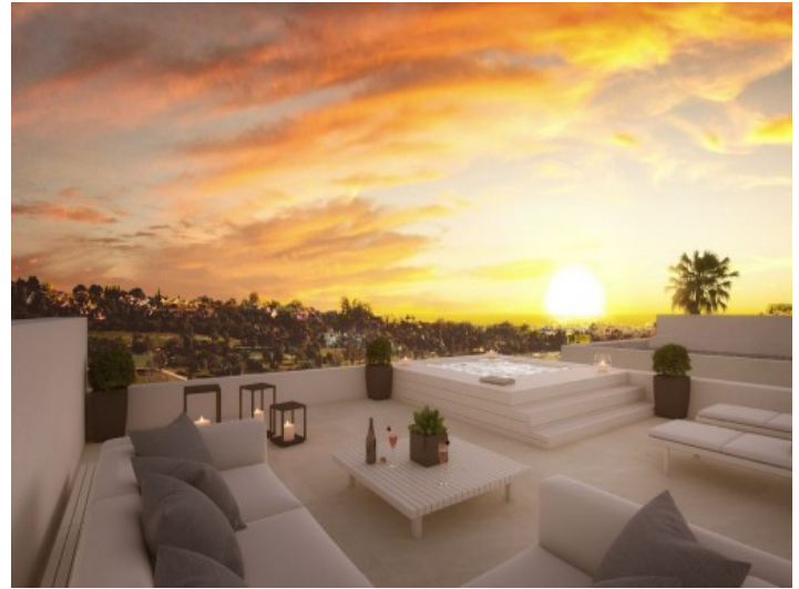
Roof top terrace at night