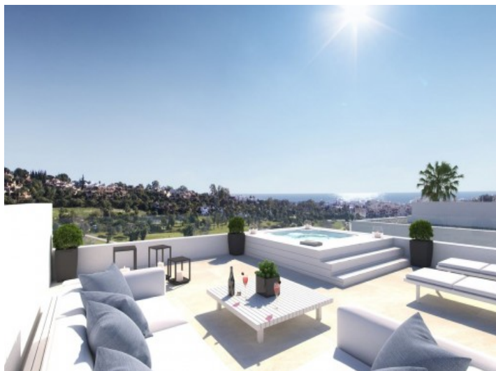
Impressive views of the roof top terrace