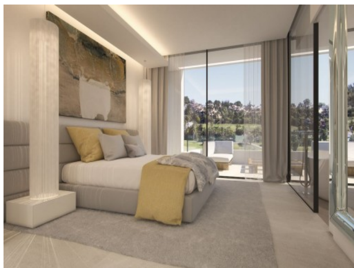
Elegant master bedroom