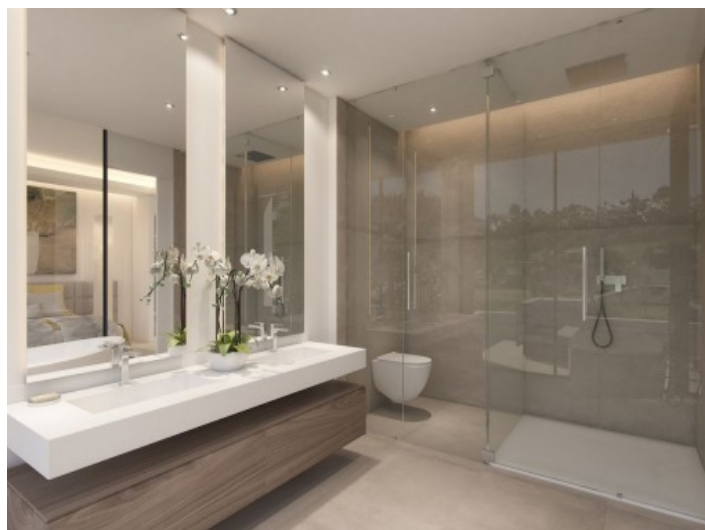
Bathroom with walk-in shower

All information is correct to the best of our knowledge. Errors and prior sale excepted. This prospectus is purely for information purposes. Only the notarized deed of sale is legally binding.