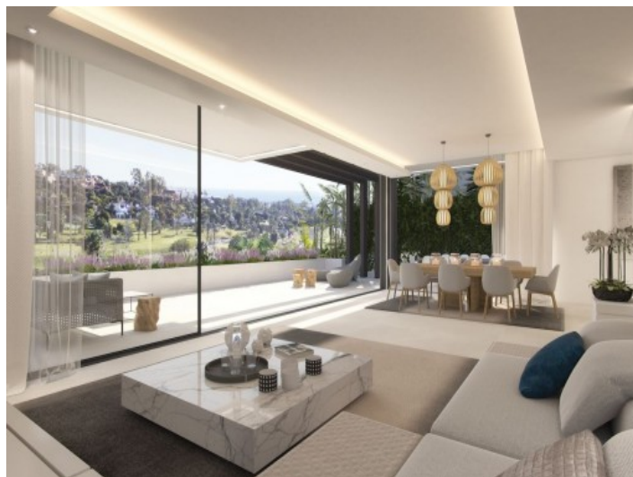
Bright living area