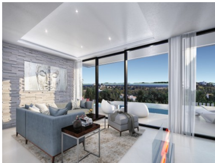
Puristic living area