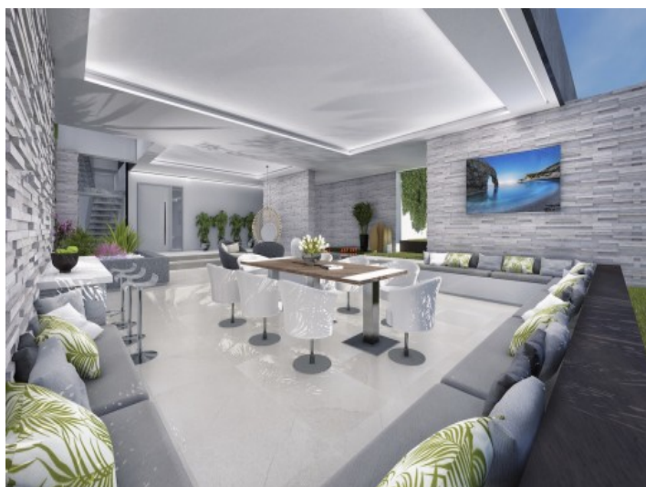
The dining area offers space for up to 8 people