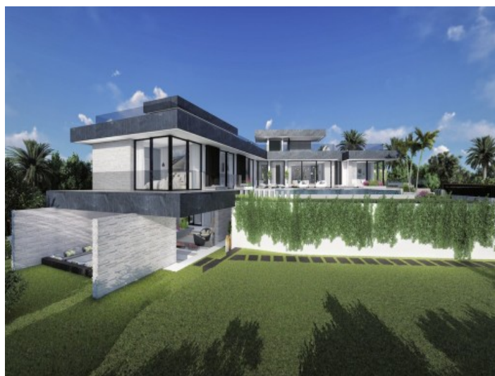
Spacious outdoor area