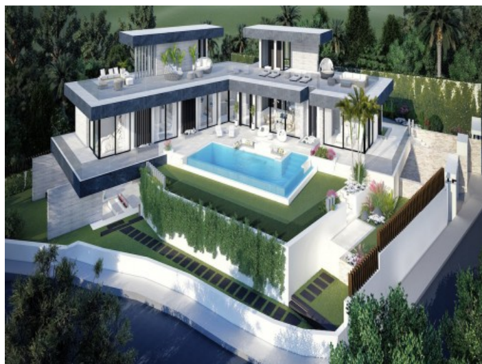
Impressive contemporary style villa in Benahavís

All information is correct to the best of our knowledge. Errors and prior sale excepted. This prospectus is purely for information purposes. Only the notarized deed of sale is legally binding.