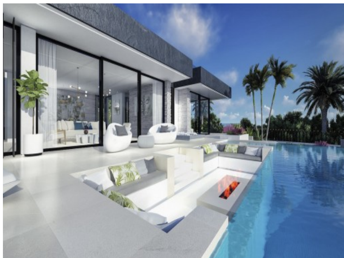
Well-maintained pool area with lounge area