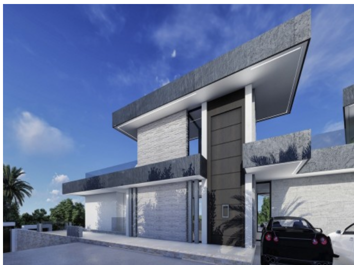
Inviting entrance area