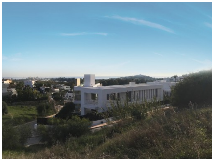
View of the project

All information is correct to the best of our knowledge. Errors and prior sale excepted. This prospectus is purely for information purposes. Only the notarized deed of sale is legally binding.