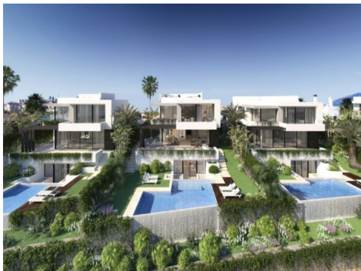
Exterior view of the modern complex