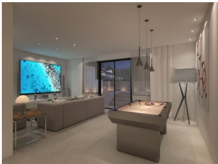
Poolroom and home theater

All information is correct to the best of our knowledge. Errors and prior sale excepted. This prospectus is purely for information purposes. Only the notarized deed of sale is legally binding.