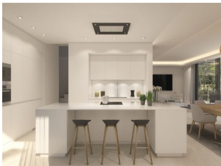
Modern and fully equipped kitchen