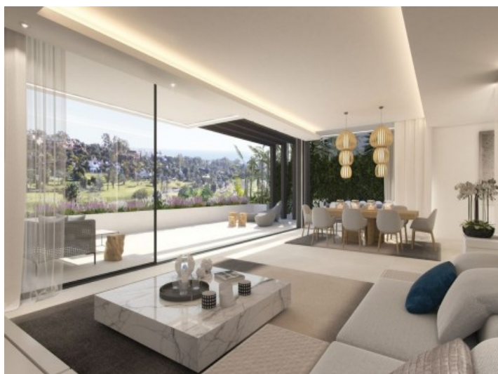
Puristic living and dining area