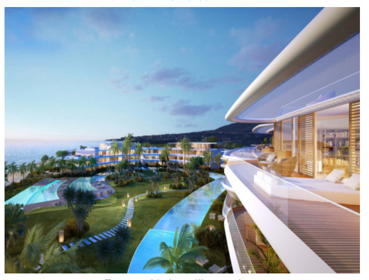
Terrace with dreamlike sea views

All information is correct to the best of our knowledge. Errors and prior sale excepted. This prospectus is purely for information purposes. Only the notarized deed of sale is legally binding.