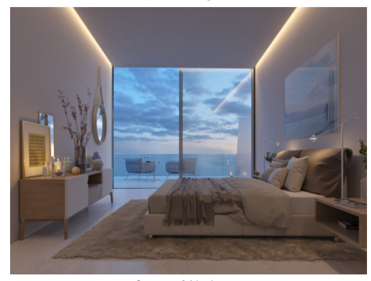
One out of 4 bedrooms