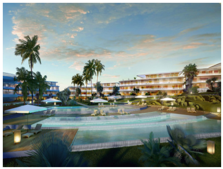
Amazing pool and garden area