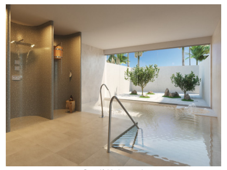
Beautiful indoor pool