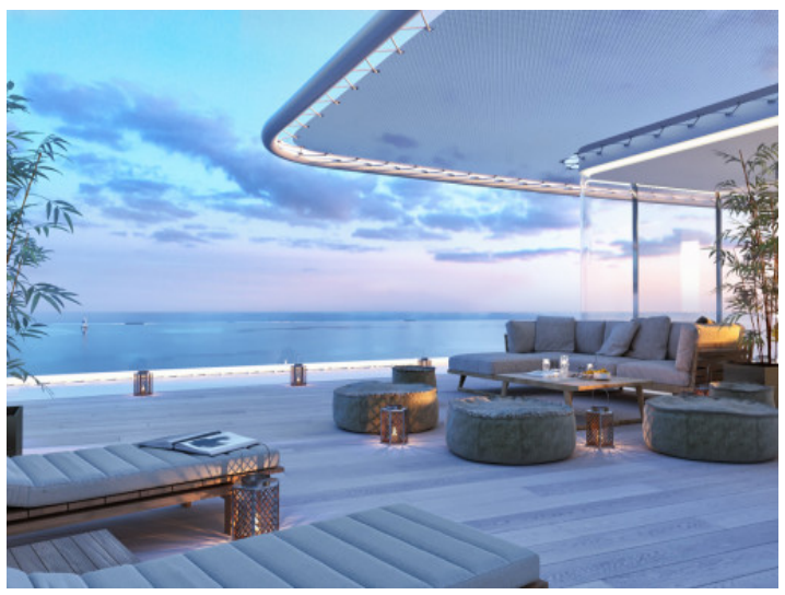
Covered first sea line terrace