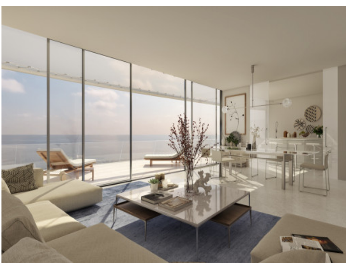
Lightflooded living area