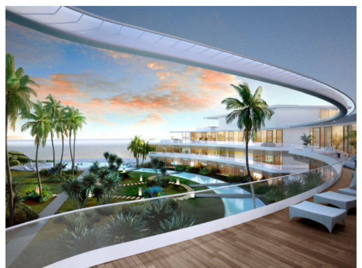
Stunning sea view terrace