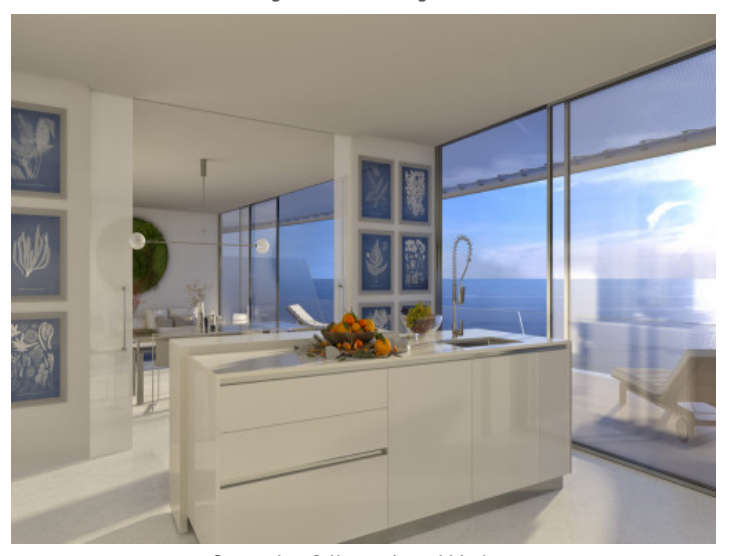
Open plan fully equipped kitchen