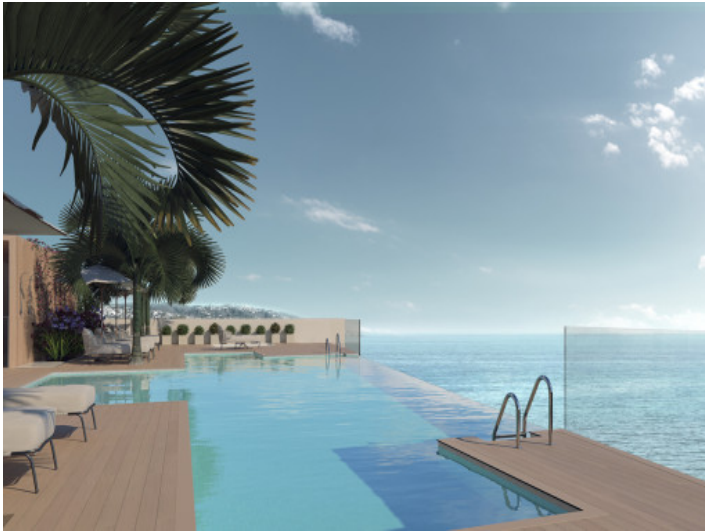
Infinity pool with unbelievable views