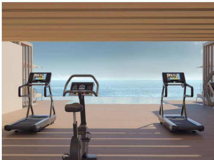
Gym in front of the infinity pool