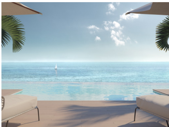
Dreamlike views from the pool

All information is correct to the best of our knowledge. Errors and prior sale excepted. This prospectus is purely for information purposes. Only the notarized deed of sale is legally binding.