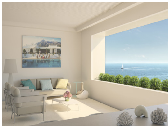
Beautiful views from the terrace