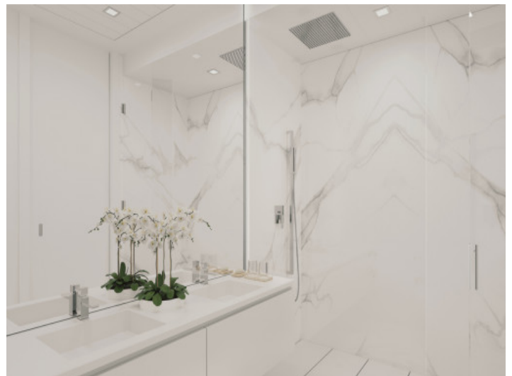
One out of 2 bathrooms

All information is correct to the best of our knowledge. Errors and prior sale excepted. This prospectus is purely for information purposes. Only the notarized deed of sale is legally binding.