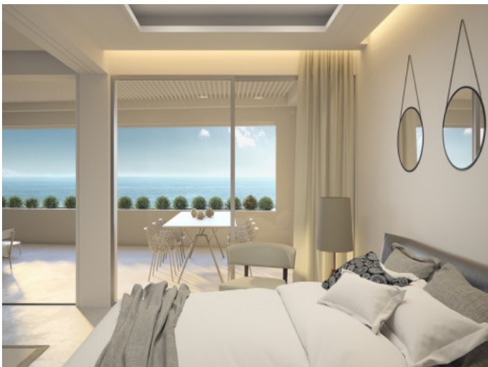
Bedroom with stunning views