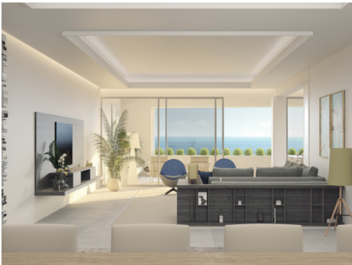
Brand new, spacious penthouse at the beach