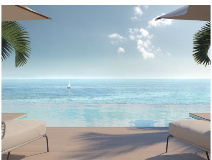
Dreamlike views from the pool