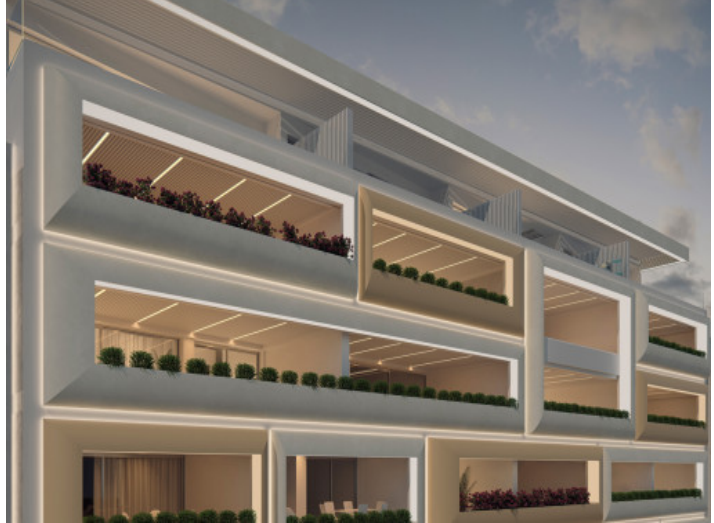
Exterior view of the luxury apartments