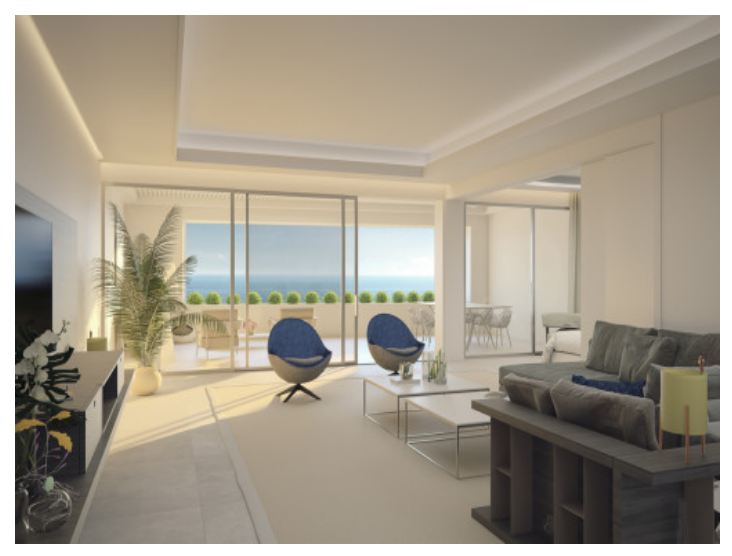
Modern designed living area