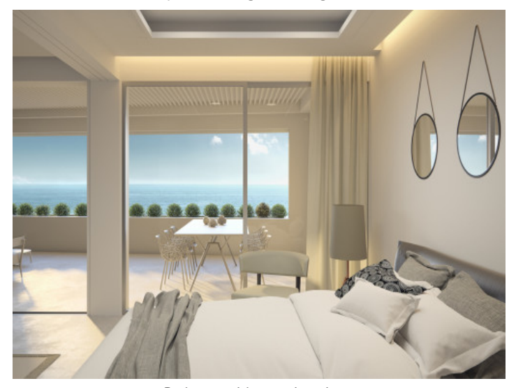
Bedroom with stunning views