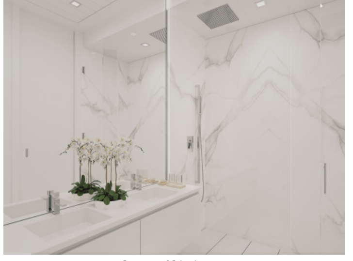
One out of 2 bathrooms

All information is correct to the best of our knowledge. Errors and prior sale excepted. This prospectus is purely for information purposes. Only the notarized deed of sale is legally binding.