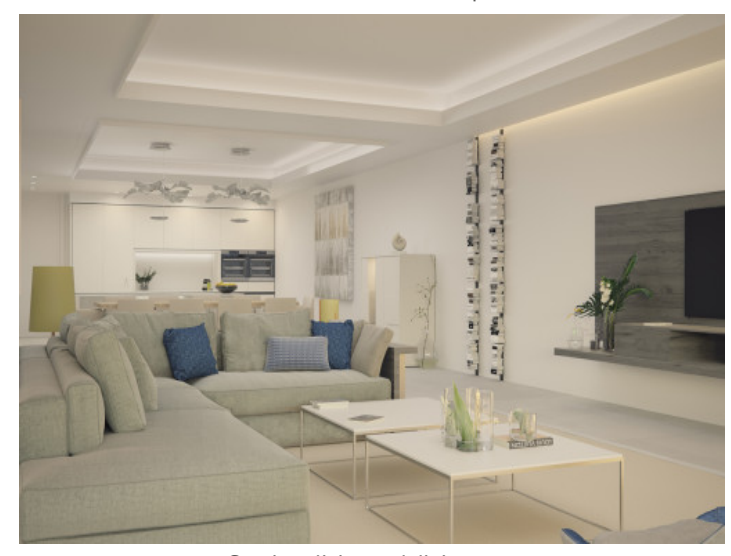
Spacious living and dining area